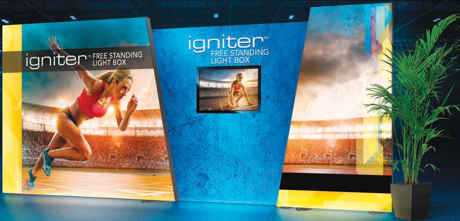
IGNITER - FREE STANDING ANGLE LIGHT BOXES